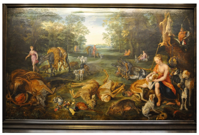
Brueghel and van Balen– The material is organized