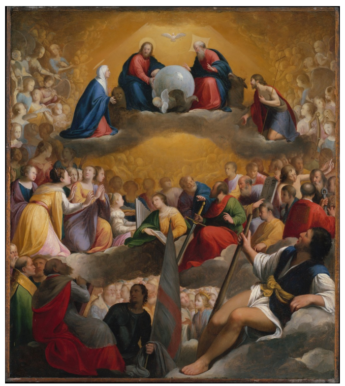
Paradise is often depicted with humans - Carlo Saraceni