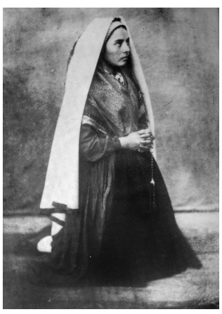
Bernadette Soubirous praying

Pray writing to your family or your friends.