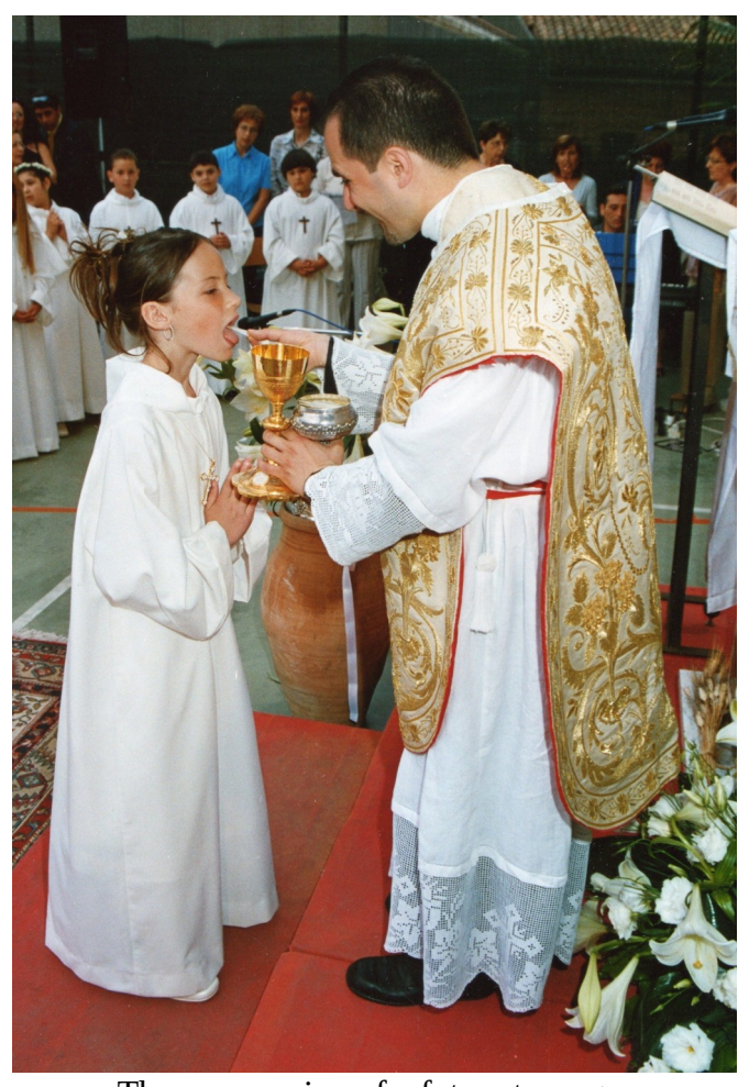
The communion of a future teenager