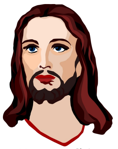
Western Jesus Christ