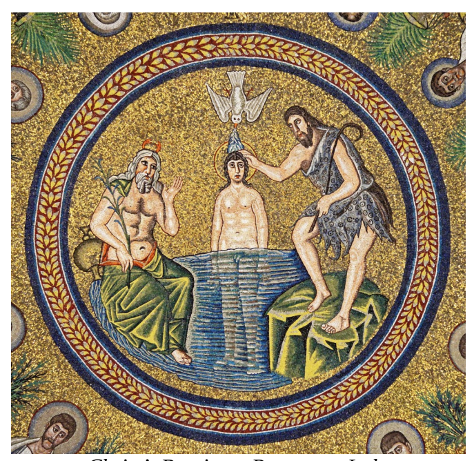
Christ's Baptism - Ravenna - Italy