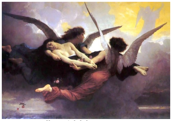
William-Adolphe Bouguereau Soul brought to heaven