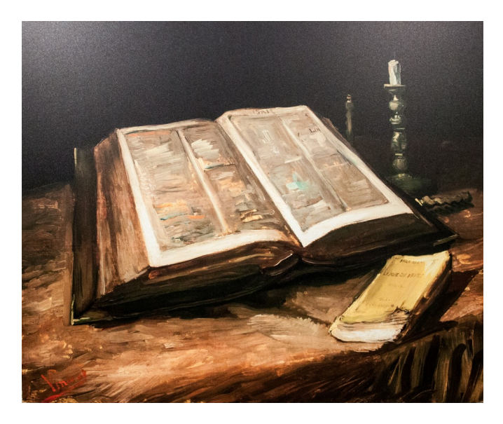
Van Gogh - The Bible

Join the church to read the Bible with them.