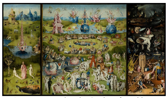
Hieronymus Bosch - The Garden of Earthly Delights

Write about your mistakes and how to solve them.